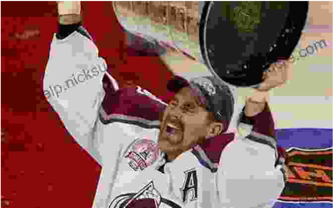
Ray Bourque's long-awaited Stanley Cup victory

in the team's championship victory. His triumph marked a poignant end to an illustrious career and brought immense joy to the Bruins faithful.