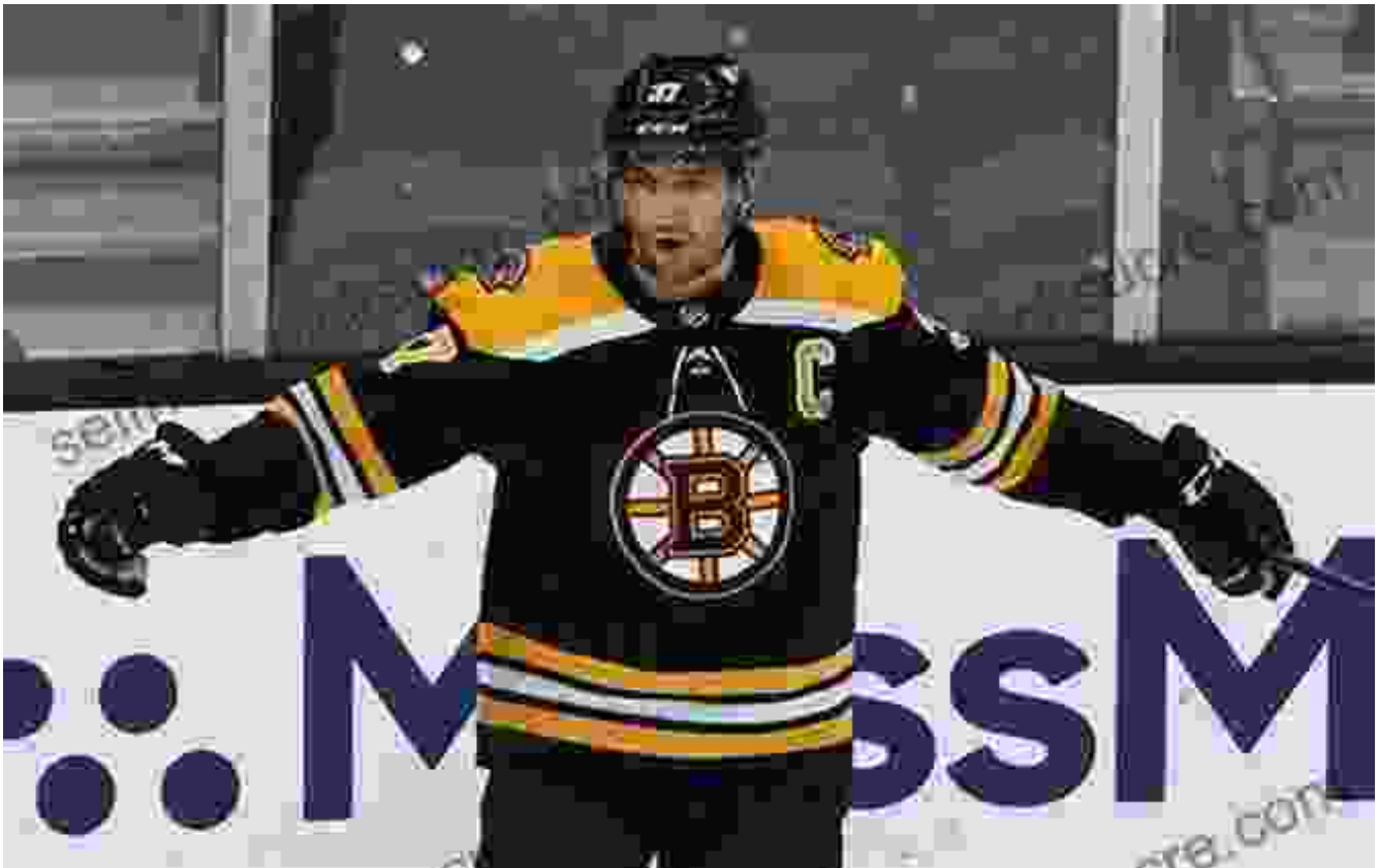
Patrice Bergeron, the Bruins' current captain

leadership and dedication have made him a fan favorite and a true embodiment of the Bruins spirit.